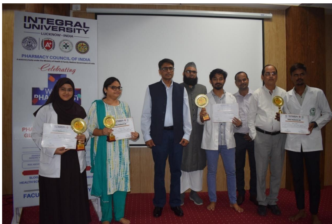
Figure 2 Slogan Writing Competition prize and Certificate Distribution