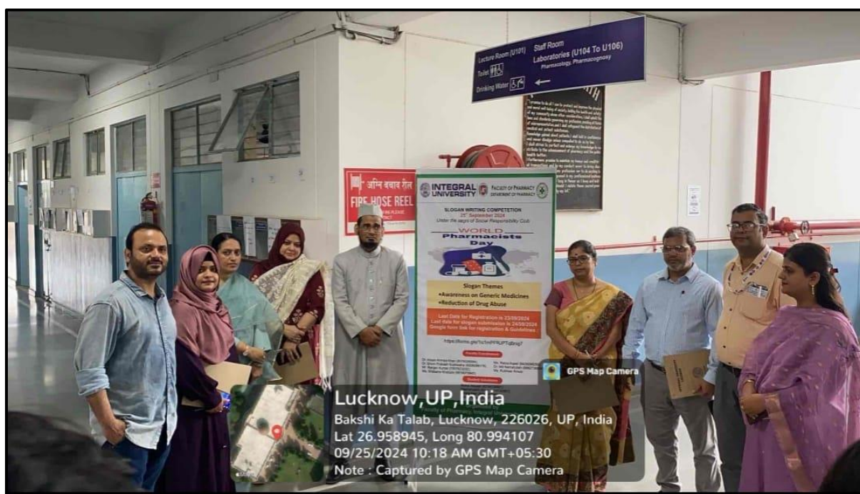
Judges of Slogan writing competition along with organizing team

The event complied with PO1, PO7, and PO8 by highlighting pharmacists' roles in drug abuse prevention, ethical healthcare, and public communication, while supporting SDGs 3, 4, and 17 through health advocacy, educational activities, and academic-healthcare collaboration.